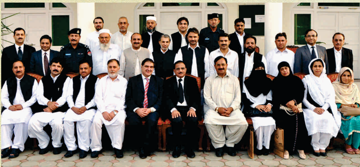
Participants of Workshop on Nizam-e-Adl