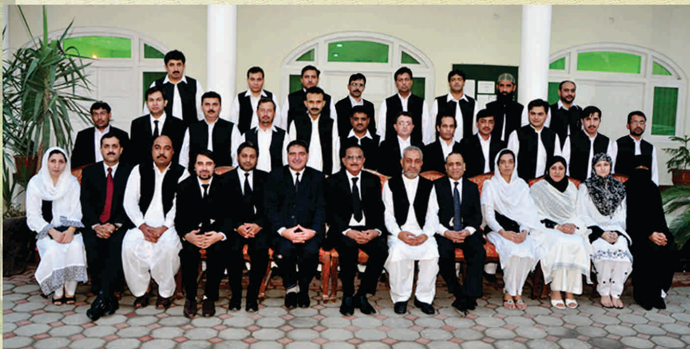
Group Photo of 2nd Training (1-6 Oct 2012)