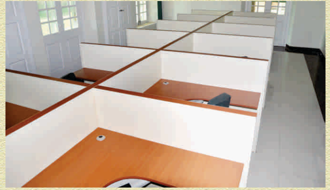
Computer Lab & Work Stations for Researchers