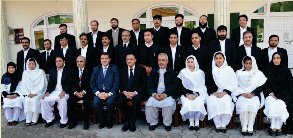
Group Photo of 4th Training (3-8 Dec, 2012)