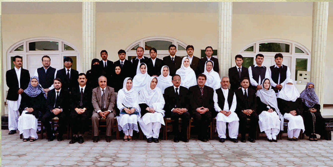
Group Photo of 3rd Training (5-10 Nov 2012)