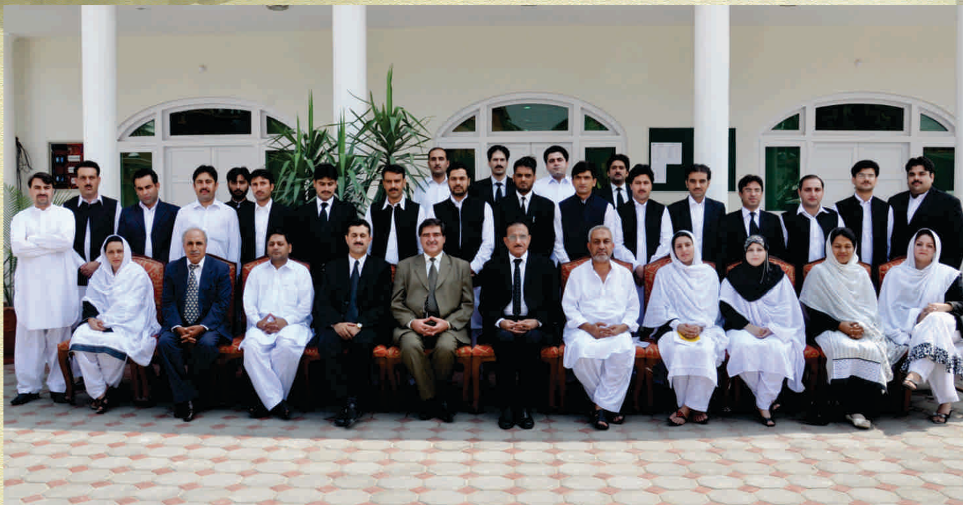
Group Photo of 1st Training (27 Aug - 1 Sep 2012)

So far four trainings have been successfully conducted. In terms of the number of trainees, the Academy has made a century. Academic calender for the year 2013 has been made, and it is scheduled that all the judicial officers serving in KP Province will be trained.